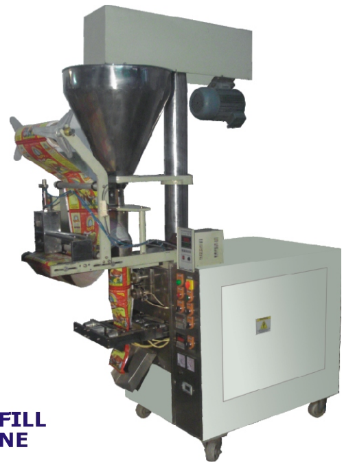
WITH AUGER FILLING SYSTEM