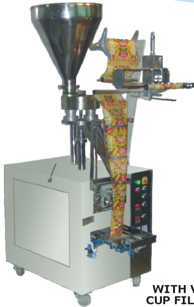
WITH VOLUMETRIC CUP FILLING SYSTEM