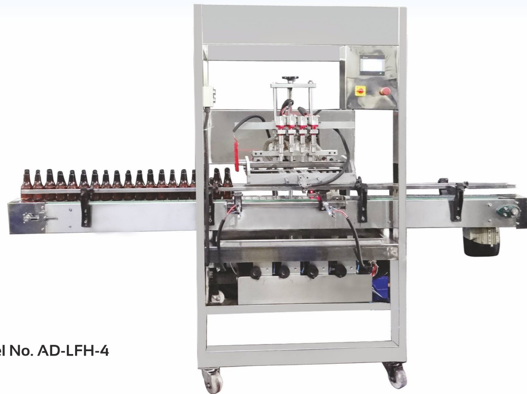
Model No. AD-LFH-4