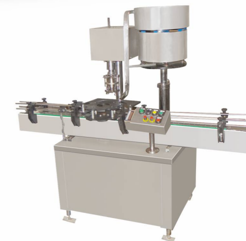
Model No. AD-CM-I