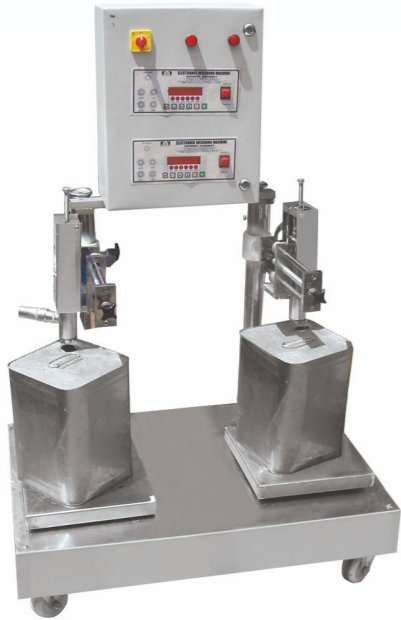
Double Head Model No. AD-TF2