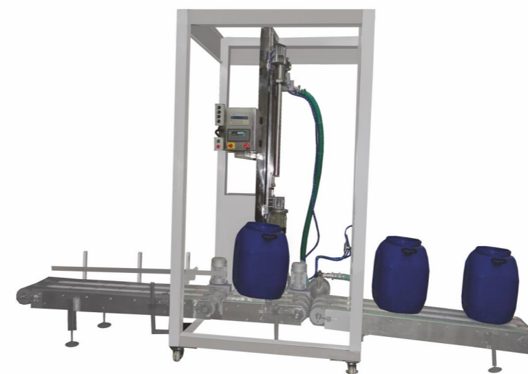
Model No. AD-DFW