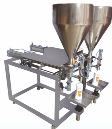
Model No. AD-LF-V-2