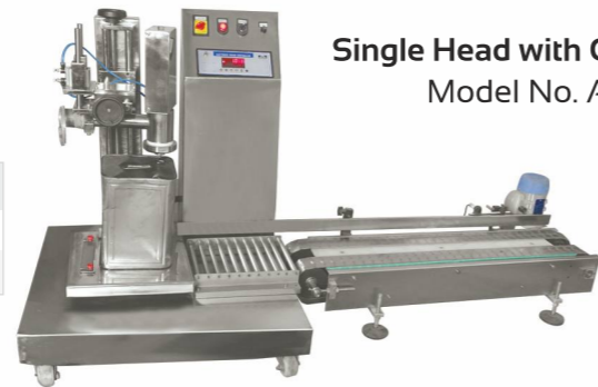
Single Head with Conveyor Model No. AD-TF1-C

Conveyor system for transfer of tin after filling